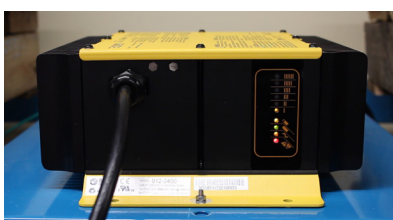
Figure 4: Charger LED indicator self-test.