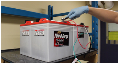
Figure 2: Remove positive lead from positive terminal on the battery pack.