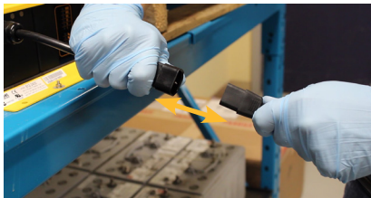
Figure 1: Disconnect AC power.