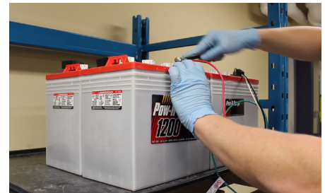
Figure 8: Reattach the positive lead to the positive terminal after disconnecting AC power.