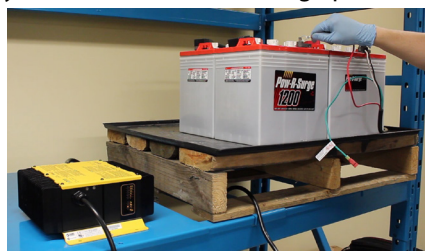
Figure 7: Touch the positive lead to the positive battery terminal for 3 seconds.