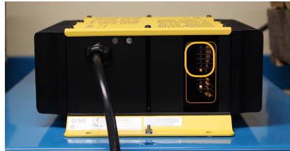
Figure 5: Charge profile #1 on the ammeter.