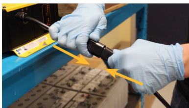
Figure 3: Reconnect AC power to the charger.