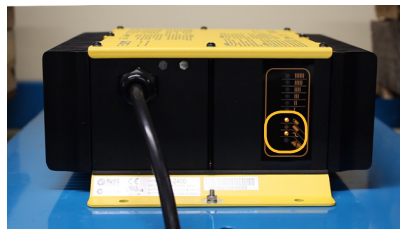
Figure 6: Bulk charge indicator displays charge profiles 7 and above.